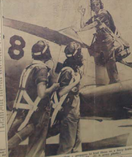
She (Diploma) stands to the left of the Oerlikon gun... prepare to land them on a ferry flying field.