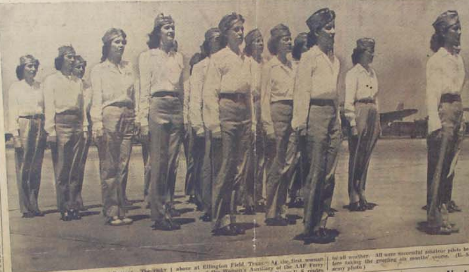
Spring graduates of College of Daughters... above at Ellington Field, Texas: At the first woman job of ferrying war planes went with the diplomas which were proudly received last month by the class.